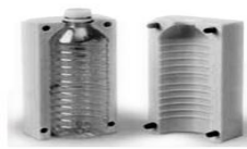
Tạo khuôn mẫu