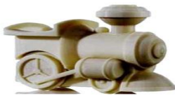
Thiết bị dạy học trực quan