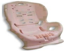
Chi tiết ô tô

http://www.digitaltrends.com/cool-tech/stalacight-lamp-shades/#/5